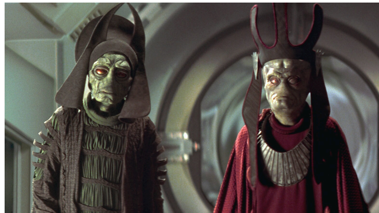
These are images of the Trade Federation Battleship and the two Leaders Viceroy and Viceroy Nute Gunray